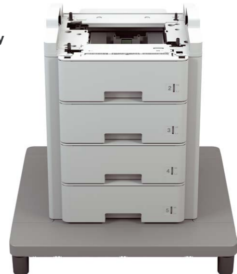
TT4000 tower tray

All models support additional tower tray