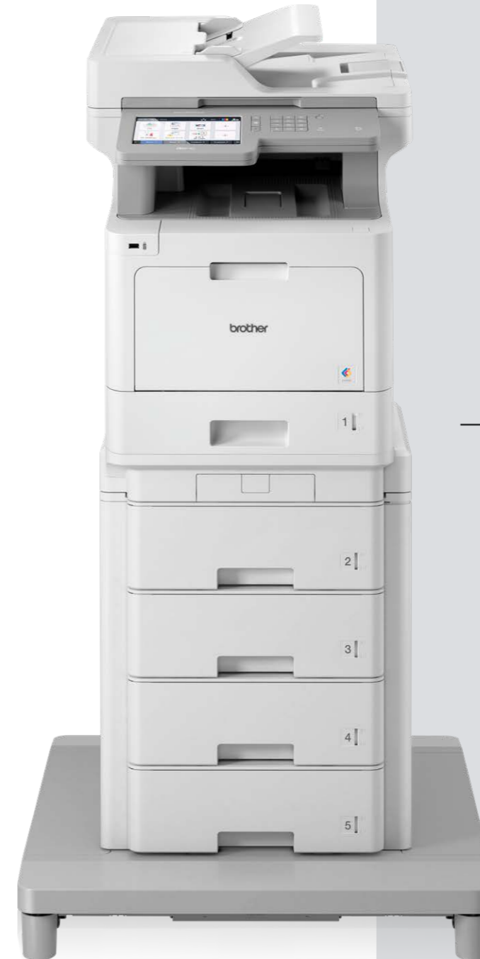
MFC-L9570CDW plus TC4000 tray connector and TT4000 tower tray