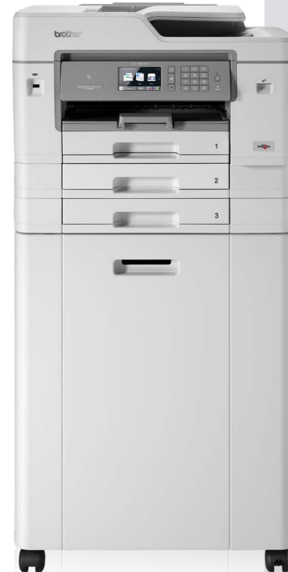
MFC-J6947DW plus cabinet