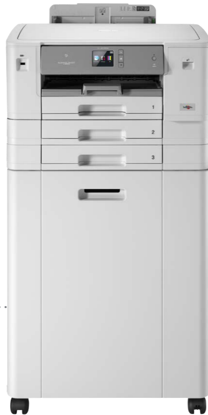
HL-J6100DW plus cabinet