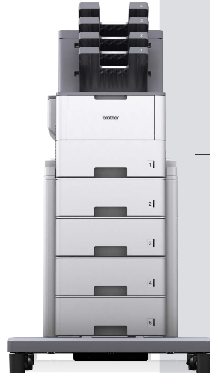
HL-L6400DW plus TT4000 tower tray and MX4000 Mailbox