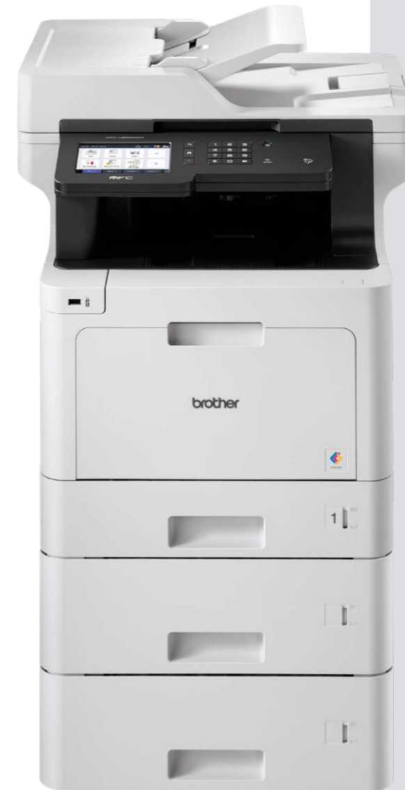
MFC-L8900CDW plus 2 x LT340CL lower tray